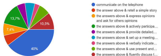
I can... 95 risposte

As extra result we would like to reach a higher rate in the last field.